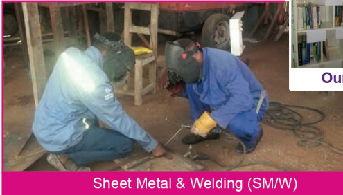
Sheet Metal & Welding (SM/W)