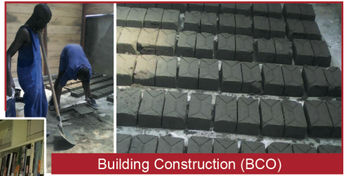
Building Construction (BCO)