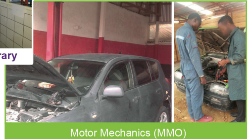
Motor Mechanics (MMO)

OUR STAFF : Qualified, experienced and very devoted